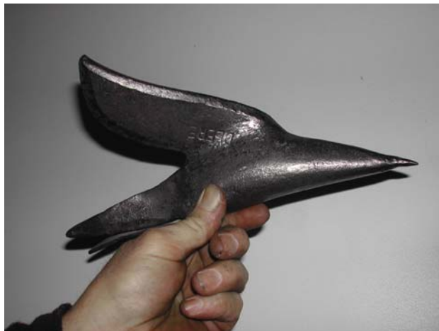
Al Olson's bird