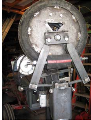
Power hammer for silent auction- see page 15 for details