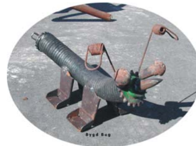
"Found art" masterpiece "Bygd Bug" created in 2006 by Monty Bygd