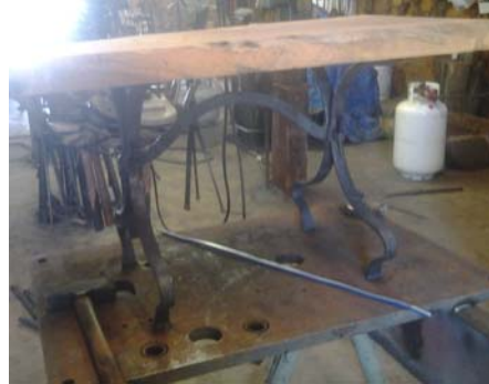
Nearly finished bench