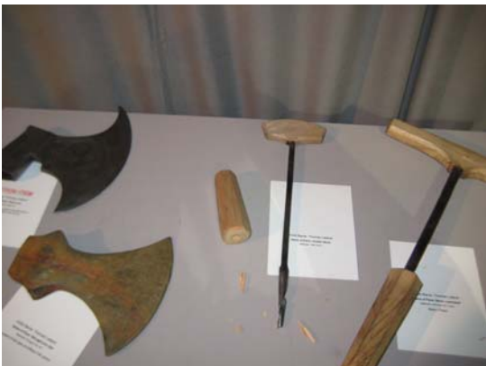
Tom Latane' exhibited many of his pieces in the gallery. The broad axe head pictured in the upper left corner was donated and sold at the live auction as the highest fund raiser of the evening.