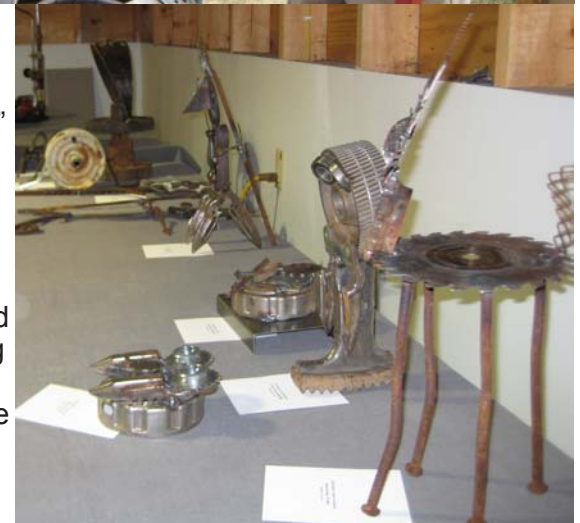
The photo at right shows many of the artistic pieces others created from the objects assembled on the "found art" hay racks during the conference.