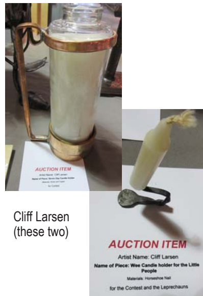
Cliff Larsen (these two)