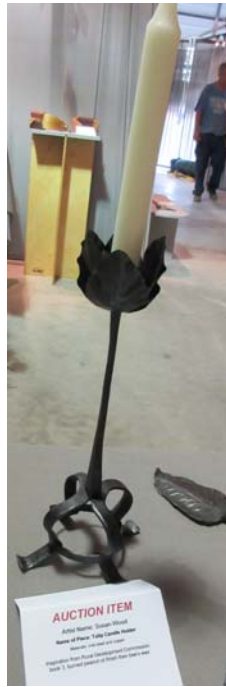
2nd, Susan Wood, $200