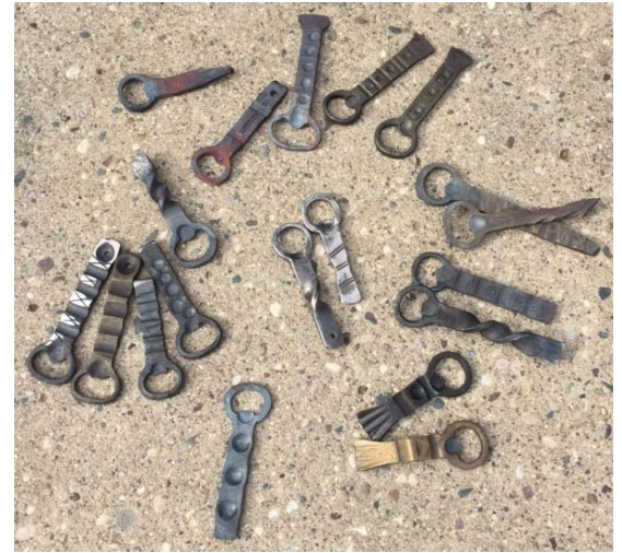
Products of their labors