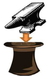
Iron in the Hat

The C.S.P.S Hall is the longest serving Czech-Slovak hall in continuous use in the United States. In 1977 The C.S.P.S. Hall was declared a National and State Historic Site. Visit their website at http://www.sokolmn.org/ to learn all about this very interesting place.