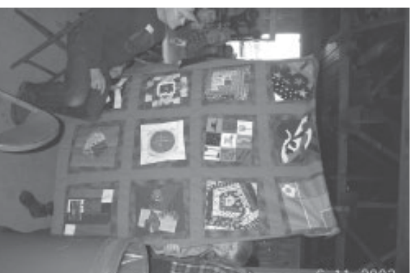
This quilt done in red, white, and blue patriotic theme is one of two that will be raffled off at the December Guild meeting.