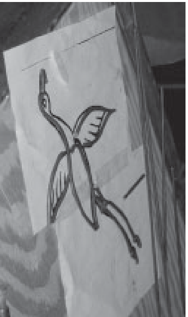
A big bird drawn at the art class. Artist not known.