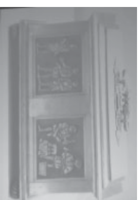
Photo of the coffer created by the "Patient Order of Meticulous Metalsmiths" for the 2004 ABANA conference. Repousse panels on this piece depicted the story of St. Clement and the blacksmith. See The Anvil's Ring , page 20, Winter 2004 for the story.