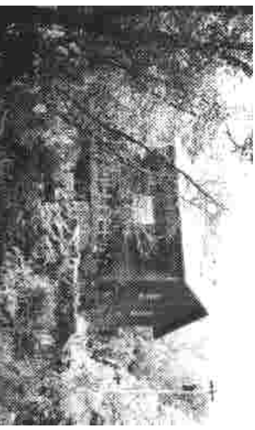
Historic Tunnel Mill near Spring Valley, Minnesota.

Fill out the registration form on the back and send it in by Monday, September 20.