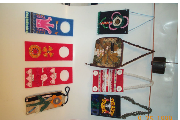
'Found art' door hangers