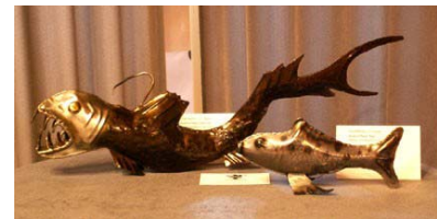
"Fish" by Jim Sage