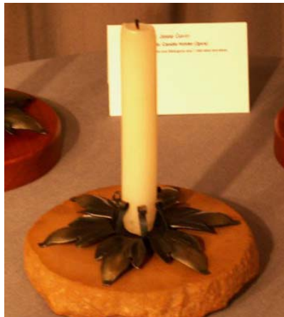
"Candle holder" by Jesse Gavin