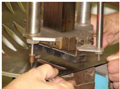
Dan Pate's louvre die