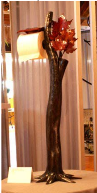
"Toilet paper holder" by Myron Hanson