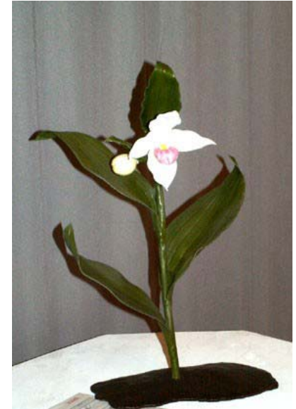
"Lady slipper" by Bill Krawczeski