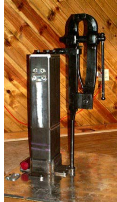
Post vise restored by Rob Murray, included in raffle drawing

The Guild of Metalsmiths PO Box 11423 St. Paul MN 55111