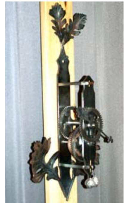
"Clock" by Susan Wood