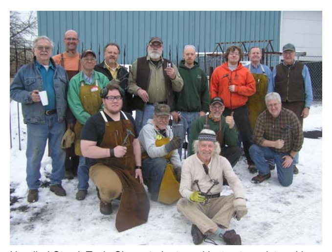
Handled Struck Tools Class students and instructors pictured here include:

Step by step instruction in the shop guided the students through forging a punch and chisel complete with heat treating. The use of the Treadle Hammer was key to the punching of holes that was later used to attach a custom made handle. The completed Handled Struck Tool is an excellent skill building class and a great addition to the blacksmithing tool set.