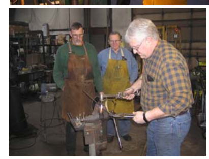
Four shots of shop time at the 2019 Handled Struck Tools Class!