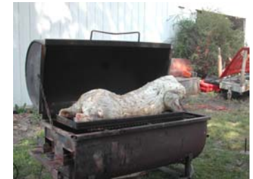
Sacrifice is ready!