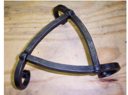
Scroll-leg style trivet