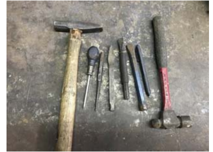
Above photo shows tools Craig used for the sign.

To register for this pre-conference class, send a check for $200 made out to The Guild of Metalsmiths to: