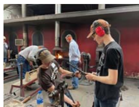
3. Teamwork on a complex bend.