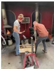
2. Hammer accuracy is key.