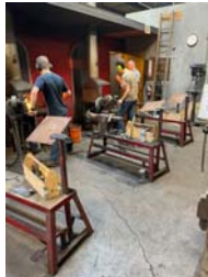
8. Starting the scrolling exercise, Day 3.