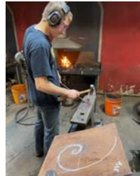
9. A good start to the scroll.