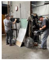
6. The instructors improvising to re-handle a forge blower and a hammer.