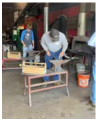
1. Students drawing tapers, Day 1.