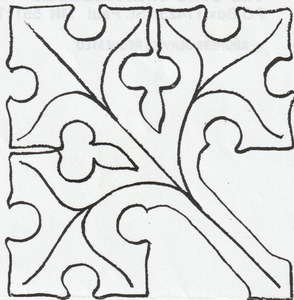
Full scale pattern of project leaf